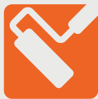
LONG NAP ROLLER FOR ROUGH SURFACES