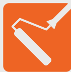
SHORT NAP ROLLER FOR SMOOTH SURFACES