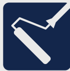
SHORT NAP ROLLER FOR SMOOTH SURFACES