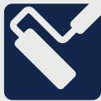
LONG NAP ROLLER FOR ROUGH SURFACES